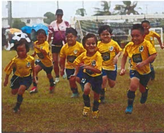
Youth participate in the Robbie Webber Youth League program.

Beyond competition, the Robbie Webber Youth League plays a critical